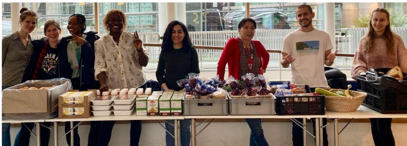
Grassroots initiatives: food sharing network, repair event, toys library, bike kitchen, free-boutique and people's kitchen.

Cities are spaces of overconsumption, waste-intensive production, and high environmental footprints. Globally, food waste makes up a third of all food produced, the construction sector creates a third of the world's overall waste, and the generation of electronic waste is scaling at vertiginous rates. This steady consumption growth and overuse of resources is being responded to by a wealth of emerging grassroots innovations engaging with ecological alternative practices.