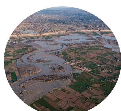
Ebro basin, Spain